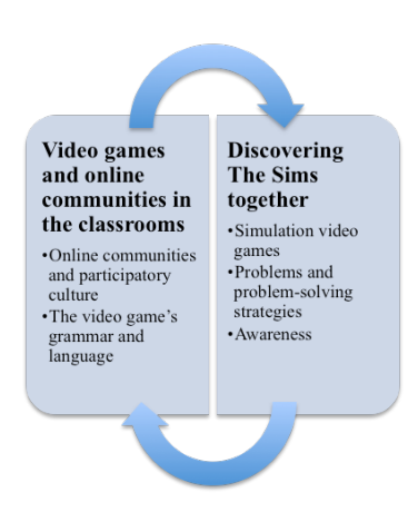
Figure 1. The online community and the video game in an educational context