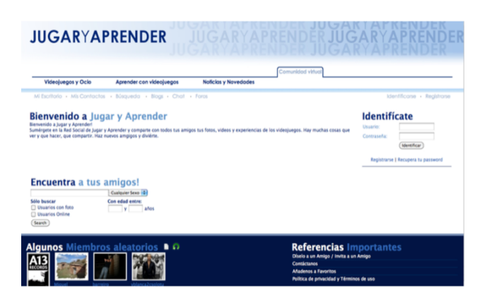
Figure 3. The social network Jugar y Aprender [Play and Learn]

At first, the students played The Sims 3 in small groups inside the classroom (during 10 sessions, 50-minute long each). Then, they participated in the online community Jugar y Aprender (Play and Learn) (http://uah-gipi.org/red/), created by the researchers to support game sessions and facilitate joint reflection. The use of this tool in a school context creates an educational space where students interact around common goals defined in the classroom (Cortés, García-Pernía, & Lacasa, 2012). This online community was structured in different sections: a section called My Desk where students could create their own space to identify and introduce themselves; a contact section to connect with peers; and also several sections of dialogue and reflection through blogging, forums and chats.