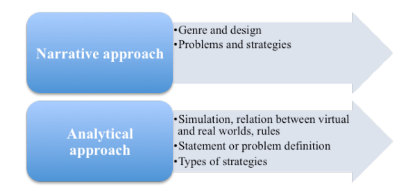
Figure 4. Categories for analysis

The approach to the data was inductive. From the speeches of the participants in the forum, a system of categories was developed that allowed the examination of the data obtained by applying it to all interventions. The software program Atlas Ti was used to perform this analysis.