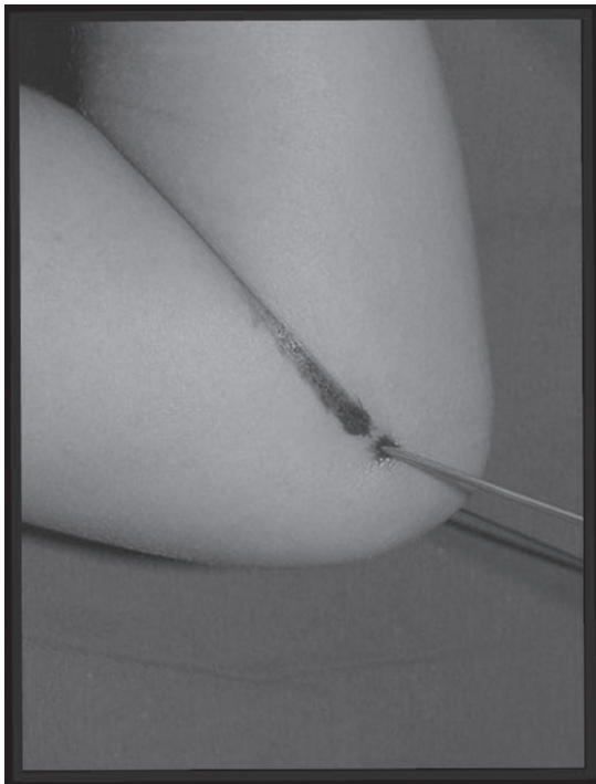
Figure 1. Internal antecubital fold line. Useful to identify the entry site of nails into the internal epicondyle and avoid ulnar nerve injury.

treated in the emergency department of the Carlos Ardila Lülle clinic, Bucaramanga, Colombia, Southamerica, in the period between August 2000 and September 2006. The inclusion criterion was established for absence of anatomical abnormality of the elbow prior to fracture. We excluded patients with neurological disorders, bone dysplasias, history of infection or fracture in the elbow committed and syndromes associated with musculoskeletal disorders. The senior author performed in all patients retrograde crossed nail fixation, using the distal extension of the antecubital fold line for the identification of the internal epicondyle. The first step was to perform closed reduction and verification of complete reduction with the use of fluoroscopy. With a metal ruler and methylene blue, he drew a line extending the antecubital fold, which intersected the internal epicondyle in all cases, then by palpation he chose the entry site of nails as shown in Figure 1.