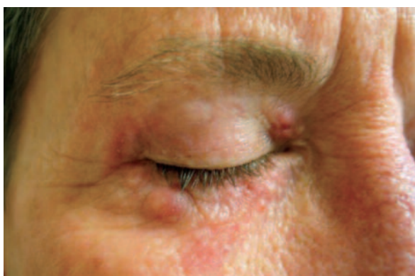
Figura 2. Right upper and lower eyelids: Erythema and visible nodules six weeks after blepharoplasty.