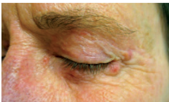
Figura 3. Left upper and lower eyelids: Erythema and visible nodules six weeks after blepharoplasty.

ment. A skin biopsy was then performed and histopathology demonstrated suppurative and granulomatous dermatitis, confirming an infection