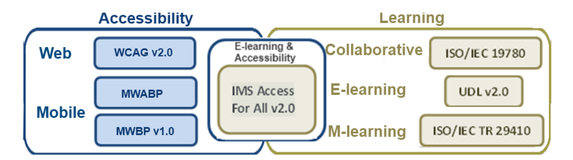
Figure 2. Standards and guidelines followed to the development of a m-CSCL.

Regarding to accessibility standards, the WCAG 2.0 guidelines [22], which specify how to create accessible Web content, are considered. Moreover, the developer should consider the guidelines MWABP [23] and MWBP 1.0 [24] which are related to the creation of accessible Web page and applications in MDs.