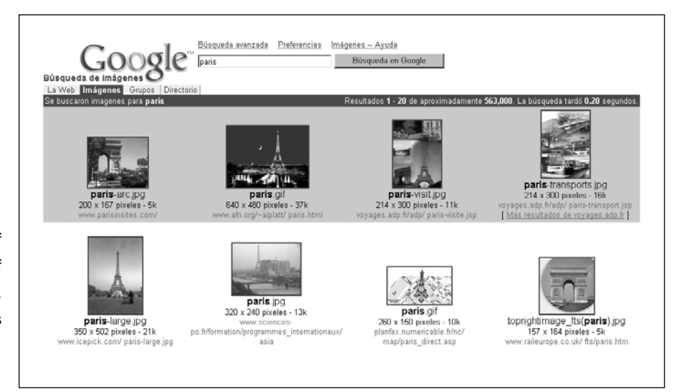
Figure 6: An image search in Google of the term "paris" produces hundreds of thousands of results (nearly 600,000), with a complete mix of genres, formats and meanings for the term