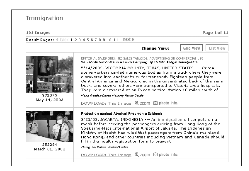
Figure 7: Result of an image search on Corbis Newsroom (newsroom.corbis.com). You can see the metainformation of each image next to the corresponding small image. You can click on the icon photo info. to obtain a list of key words with which it has been indexed (see the following figure, no. 8)

Figure 8: Key words of the image in the previous figure, as well as other additional information, e.g., source, date, format.