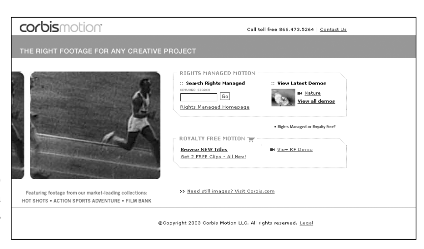
Figure 10: The Corbis Motion (www.corbismotion.com) homepage. An important image bank with a clear commercial orientation that is both B2B and B2C at the same time

Example of results from the SpeechBoot search engine (www.speechboot.com) which indexes the sound (voice) of radio and TV programmes with an automatic voice-recognition system. You can request reproduction of the voice (PLAY button) or read the text transcript (Show me more)