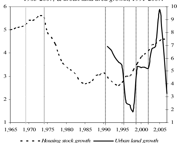
Figure 1: The Spanish construction cycle: Housing stock growth, 1965-2007, & urban land area growth, 1991-2007.

Notes: (1) Housing stock growth = % growth of the residential housing construction stock, computed as the ratio between yearly real investment in housing and the real money value of the previous year's housing stock; data from IVIE (2005); shown on the left axis; (2) Urban land growth : Growth of urban land area (Growth in built-up + Vacant developable land), as a percentage of previous year's built-up land area; data from 'Dirección General del Catastro' (several years); shown on the right axis.