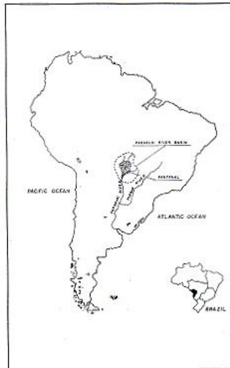
Figure 1. Map of Pantanal localization in South America. (Godoi Filho, 1986). (Mapa de la localización del Pantanal en la América del Sur. (Godoi Filho, 1986).

and populate the lands and provinces of this region. The armada (fleet) left San Lucar of Barrameda, in 1535 (Araújo, 1990) with 100 horses destined for work and reproduction,