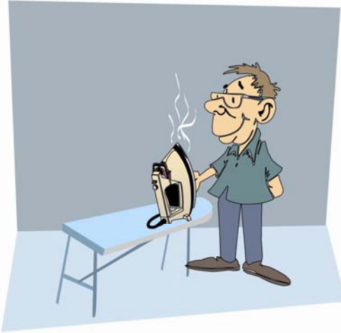
FIGURE 1. An apparently impossible act: a man touching a burning iron.

Inspired in these questions and in a paper by Byalko [5], we will show in what follows how the laws of thermal conduction can also explain such paradoxical phenomena.