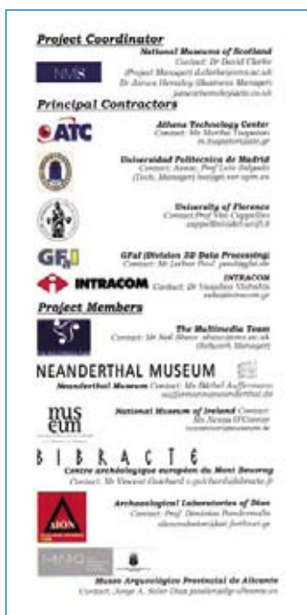
Figura 2. ORION. Members.